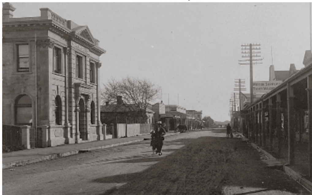
Ōtaki's Main Street was still Mill Road when this postcard was issued, c1920. The fairly new (1918) Bank of New Zealand, now the museum, is on the left. Traffic does not seem very heavy!