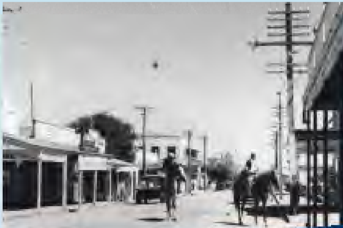
1911-14, Ōtaki in 1914

Would you like to share your memories of Ōtaki or find out more about the town's history - now and then?