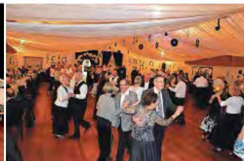
Hundreds of metres of frostcloth, musical panels and old records were used to create the elegant atmosphere