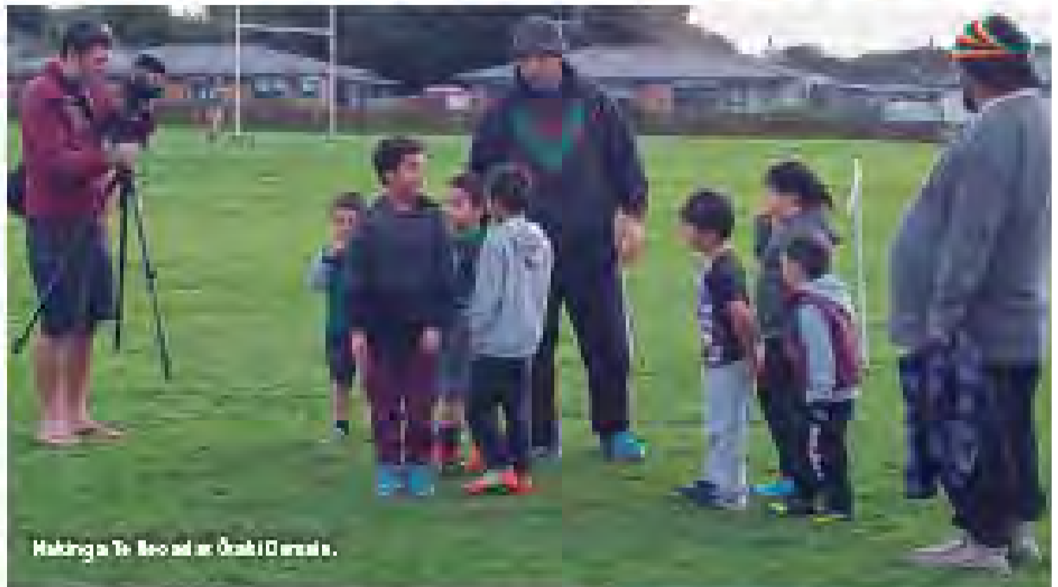
Making a Te Reo ad in Ōtaki District.

Ōtaki residents have been featured in a digital campaign Council is running to encourage people to have a go at Te Reo Māori.