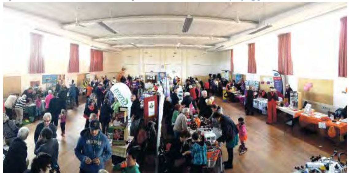
The 2015 Community Expo at the Memorial Hall. It will be bigger and better this year!