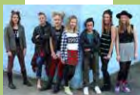
The Vibes at Bandquest P4