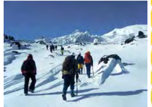
Outdoor Education students exploring Whakapapa with ‘The Pinnacles’ in the background

best youth focussed motivational speakers. He speaks on average to approximately 1.5 million young people a year. His presentation was a mixture of humour, music and messages of empowerment. Our students were captivated for 30 minutes and he left a lasting impression on all who attended.