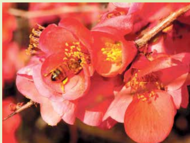
even honey bees love Quince blossoms

To preserve the shape and vigour of your shrub, you can prune virtually at any time, perhaps best when the pretty, flowering stems can be picked and taken indoors.