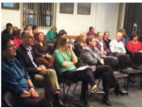
an attentive audience heard about safety on the net