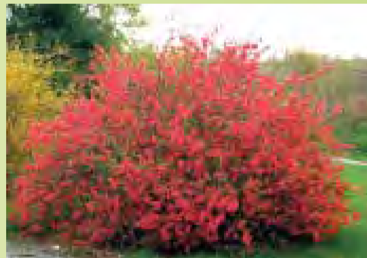
the flowering Quince is a big versatile shrub